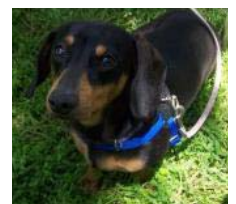
Jackson at the park