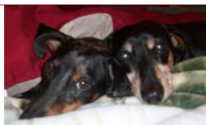
Buddy and Tucker